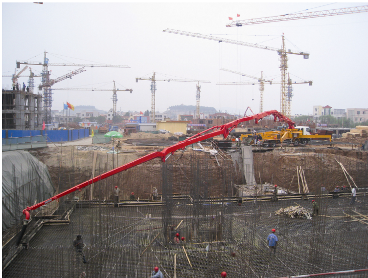
Overall Site view

of Unitech – Unibild Engg. & Construction Co. is constructing this Project. Unibild also has other PM Machines which Include a 36 M Boom Pump and two Stationary Pumps - BSA1404 D & 1407 D