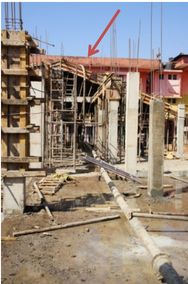
Vertical Pipe layout of around 5 meters