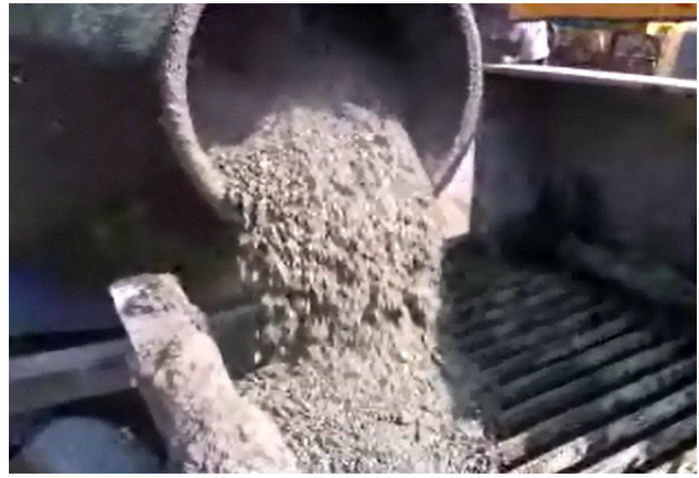
Concrete pouring from Drum Mixer to concrete pump hopper