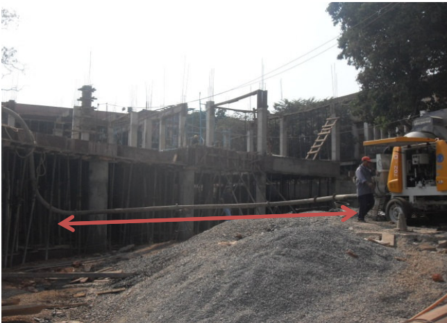
Horizontal pipe layout of around 50 meters