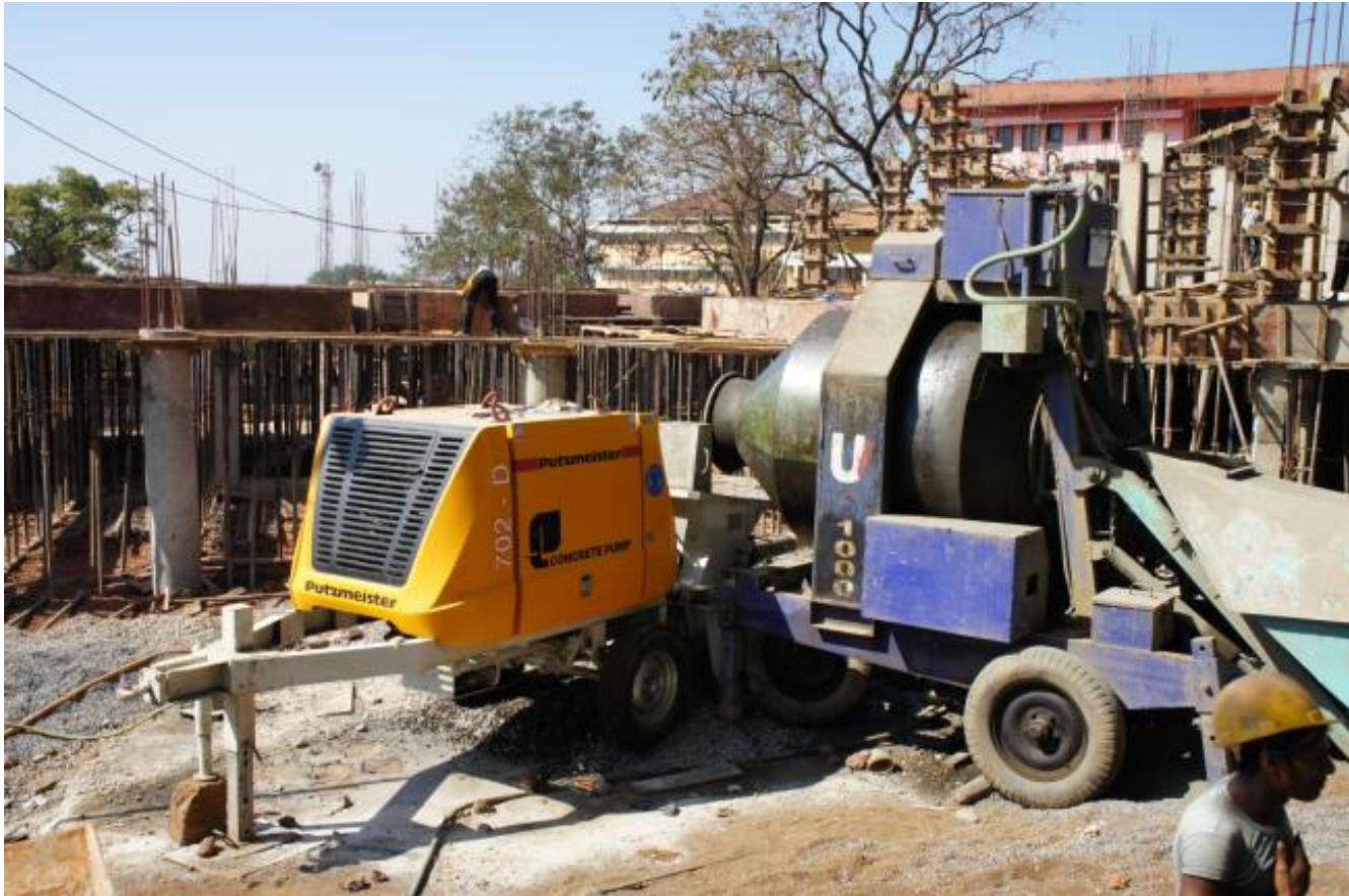
BSA 702D working at the Construction site of Govt. Medical College, Goa

The above Picture depicts the Stationary Concrete Pump BSA 702D working at the construction site for the expansion of Medical College at Bambolim, Goa. The Contractors for the Project are Ruby Realtors Pvt Ltd. who are carrying out this Project for their Client M/s GSIDC (Goa State Infrastructure Development Corporation Ltd ).