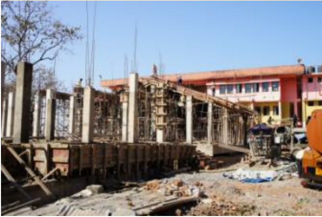
View of the Construction Site