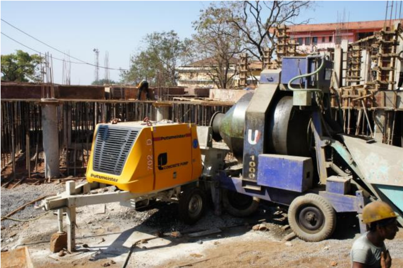
BSA 702D working at the Construction site of Govt. Medical College, Goa

The above Picture depicts the Stationary Concrete Pump BSA 702D working at the construction site for the expansion of Medical College at Bambolim, Goa. The Contractors for the Project are Ruby Realtors Pvt Ltd. who are carrying out this Project for their Client M/s GSIDC (Goa State Infrastructure Development Corporation Ltd ).