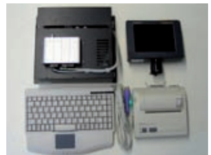
On-board computer, monitor, keyboard, printer